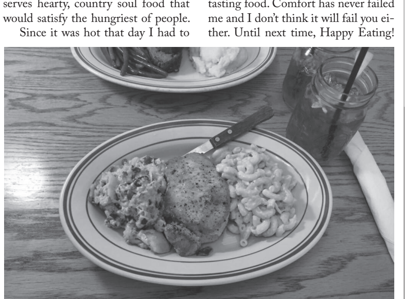
Graves's meal consisted of Southern comfort food.

The meal was delicious and scrumptious. Overall I would highly recommend Comfort for anyone looking for good food at good prices in the downtown Richmond area. I give Comfort 5 of 5 stars for the excellent tasting food. Comfort has never failed